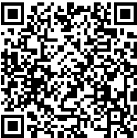
SURVEY QR CODE

Alternatively, please scan the QR Code below to complete the master plan survey electronically.